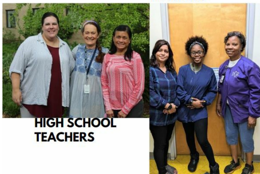
HIGH SCHOOL TEACHERS