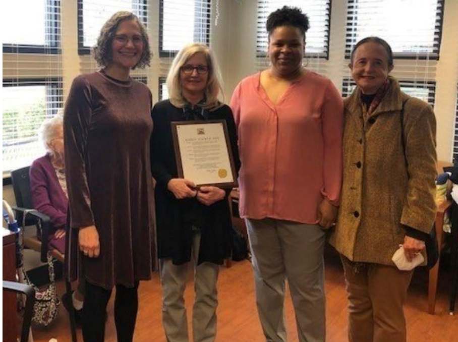
EARLY CHILDHOOD/CARE TEACHERS