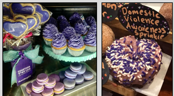
(Above) Advocates participating in Wear Purple Day.