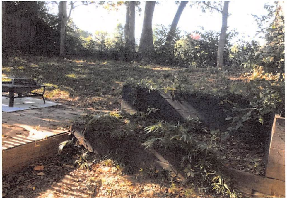
1221 MORNING SIDE DR DP