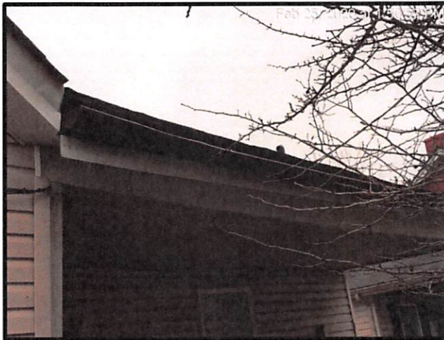
February 25, 2020