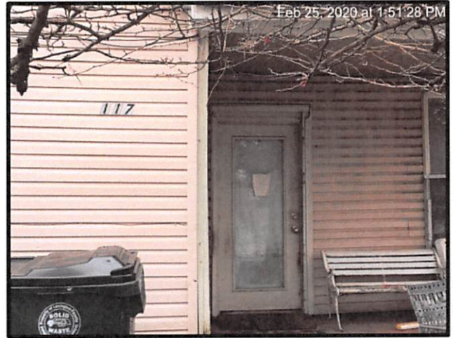
February 25, 2020