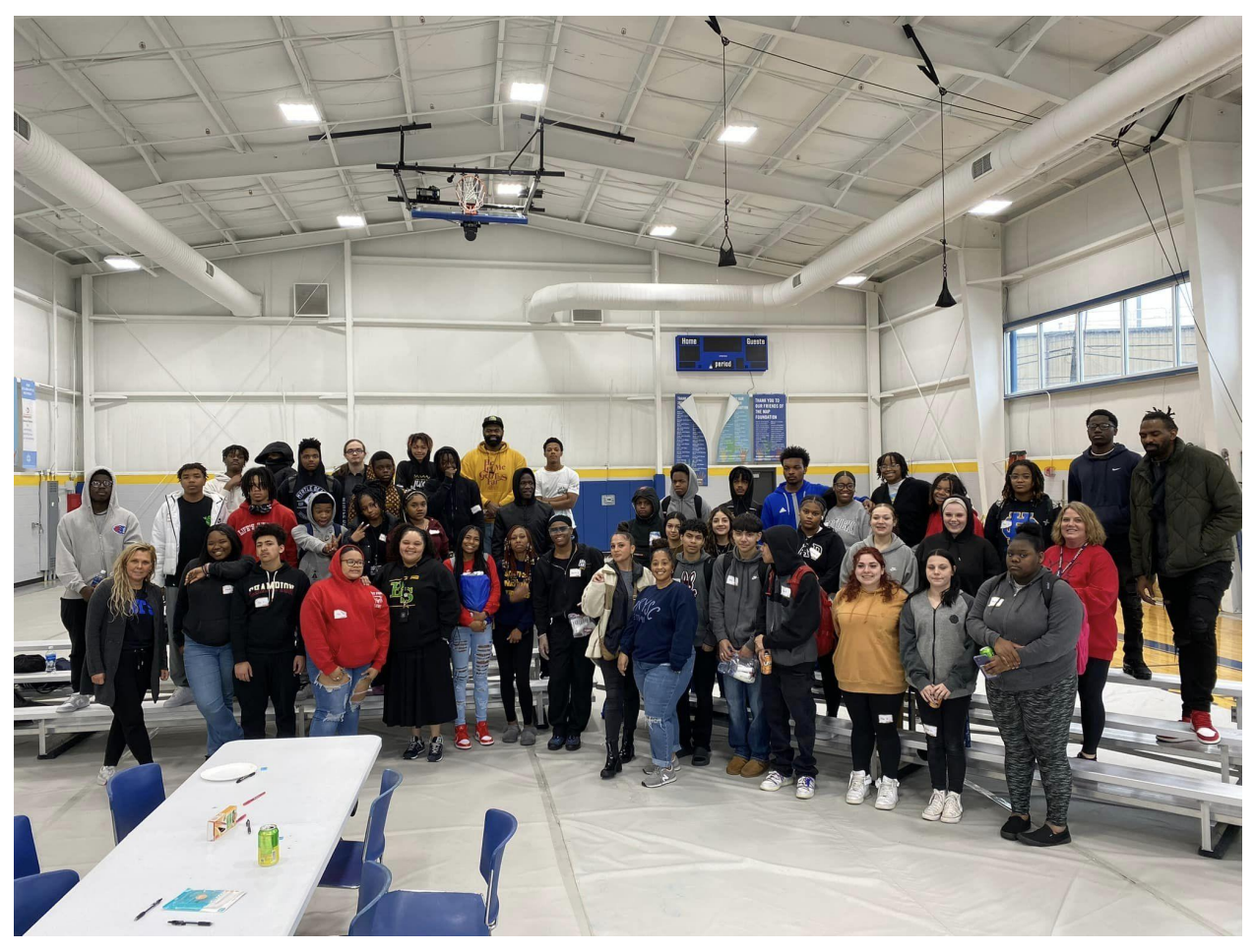
Here is a list of the schools we funded in the fall of 2023.