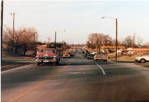
Clays Mill Road facing North. Post Road is at the right.