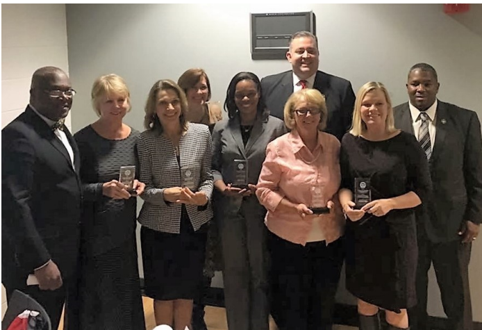
Lexington NAACP Freedom Fund Banquet at The Lyric.

The Lexington-Fayette National Association for the Advancement of Colored People (NAACP) celebrated its 2016 Freedom Fund Banquet on Thursday, November 3rd at the historic Lyric Theater in downtown Lexington, and honored the women of the Lexington-Fayette Urban County Council.