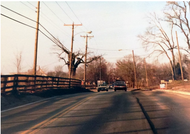
Clays Mill Road facing North just inside New Circle Road. The old Swan Farm is on the left.