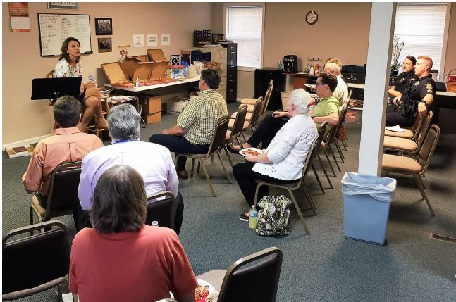
9th District Neighborhood Association Leaders meeting on October 18th at Southern Heights Baptist Church.

The 2013 Comprehensive Plan seeks to provide flexible planning guidance to ensure that development of our community's resources and infrastructure preserves our quality of life, and fosters regional planning and economic development. This will be accomplished while protecting the environment, promoting successful, accessible neighborhoods, and preserving the unique Bluegrass landscape that has made Lexington-Fayette County the Horse Capital of the World.