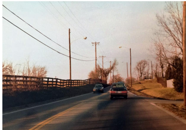
Clays Mill Road facing South just past Wellington Way.