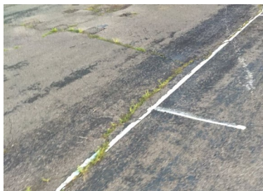
Shillito Park's basketball courts will soon be resurfaced to bring them back up to top shape.