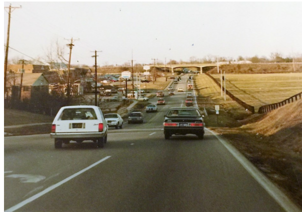
Clays Mill Road facing North. Note the Ashland Service Station in the distance at Wellington which ended at Clays Mill Road during that period.