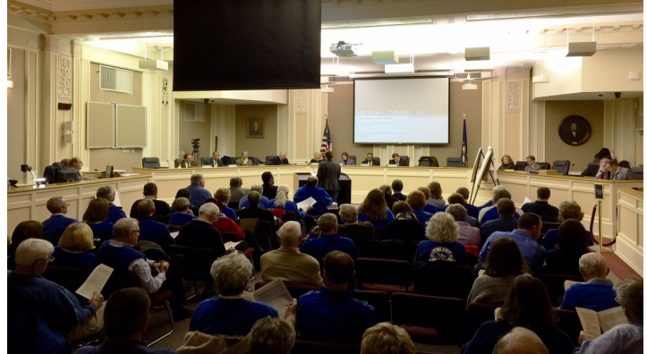
Standing room only at the February 25th Planning Commission public hearing. Watch the meeting here .