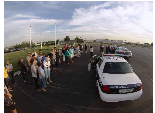
Citizen Police Academy students participating in a Police driving course demonstration.

The next Lexington Citizen Police Academy begins this month. All classes are free.