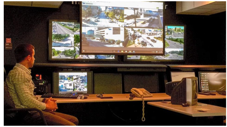
You can now access Lexington's traffic management cameras online by computer or smartphone for free.

this past week, LFCHD Environmental Health employees are visiting the areas in Lexington that have received the most complaints about mosquitoes over the past two years. Their staff will be looking for standing water and other areas that are