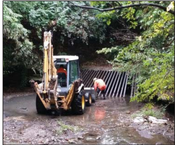
A backhoe is used to remove debris at the Parkside Cave stormwater grate

The debris in storm drains can add up; often the crew removes enough material to fill over seven pickup trucks. Some of these sites can be cleaned with a vacuum truck or backhoe, though limited