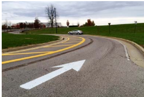
Striping changes have recently been instituted at the Reynolds Road Roundabout.

Snow Plan Revised. New for this coming winter season, the City will supplement snow removal operations through the use of private contractors. Private contractors will be utilized along five major thoroughfares: Man o' War Blvd., Polo Club Blvd., Citation Blvd., Coldstream Research Campus, and Alumni Drive