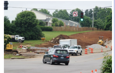
Vehicle making an illegal left turn.