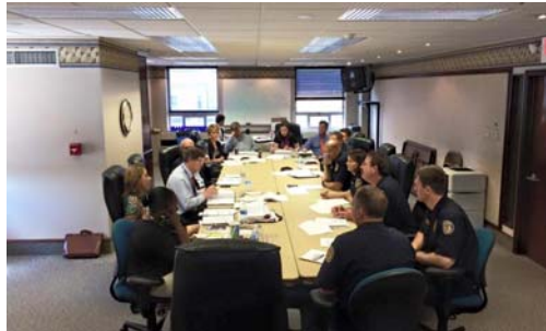
Public Safety budget meeting earlier this month.

The tree will be removed in the near future and pieces of the trunk will be taken to McConnell Springs and the Arboretum for educational display.