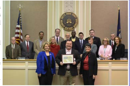
Wellington Elementary was recognized at the December 4th Council meeting.

Wellington Elementary received $300 in prize money. Way to go!