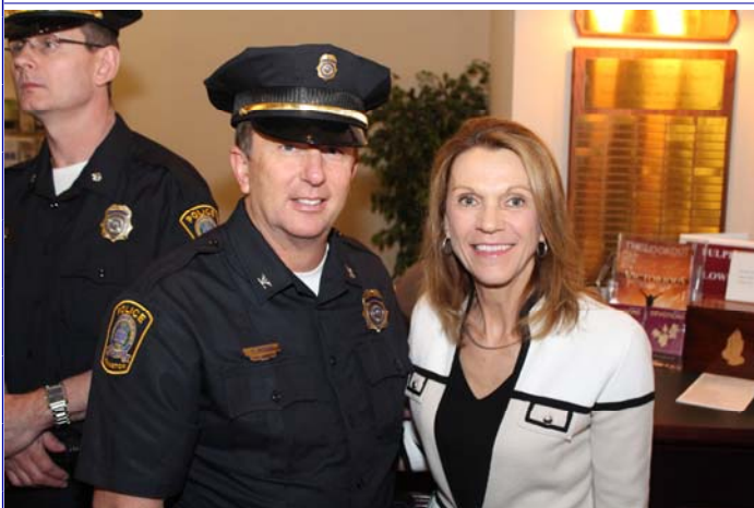
Police Chief Ronnie Bastin was confirmed by Council as Lexington's new Public Safety Commissioner on Dec. 4. File photo.