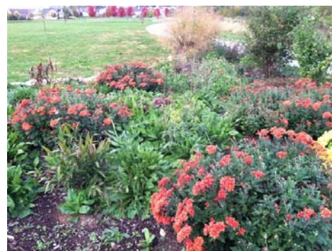
Women’s Garden. File photo.