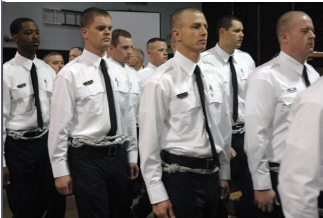
Recruit Firefighter Class 59 was sworn in on November 1.

On Saturday, November 1, thirty-seven recruits were sworn in as Lexington firefighters, including two female firefighters sworn in on the force.