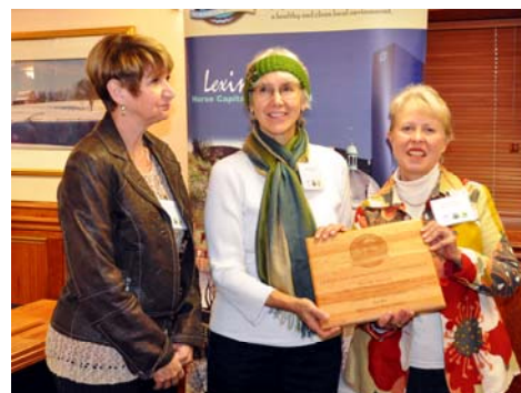
44th Annual Environmental Commission Awards.

“Wellington Park’s Lexington Women’s Garden is a bright spot of color with a good cause...”