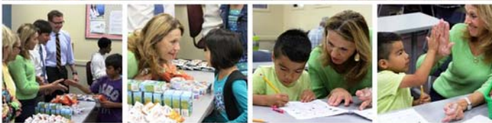
Participating in the After School Snack Program at the Village Branch Library.

I appreciate the invitation to participate in such a worthwhile community program and the opportunity to help create a movement throughout the month of September that has a real and lasting impact on God's Pantry's mission to help end hunger in Central and Eastern Kentucky.