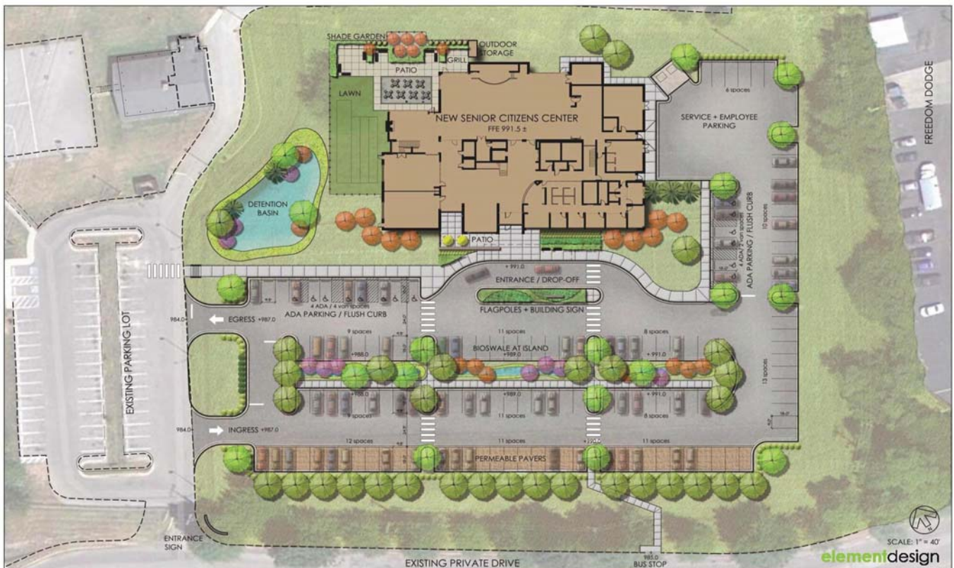
LEXINGTON SENIOR CITIZENS CENTER