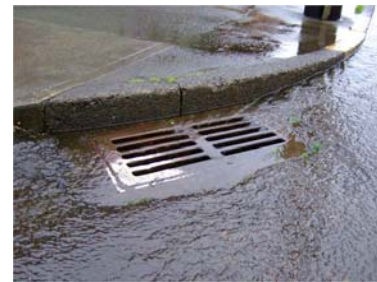
Class A Neighborhood Grants and Class B Education Grants applications are due on May 30. Class B Infrastructure Grants applications are due on August 1.

Grant application packets, contact information, sample scoring sheets and other information are available at www.lexingtonky.gov/incentives .