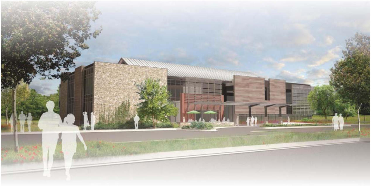
LEXINGTON SENIOR CITIZENS CENTER

At the April 15 Council Work Session, architects with EOP Architecture and Catlin + Petrovek Architects presented the Council with design plans for the new Senior Center to be built at Idle Hour Park. The center will focus on group activities, education, art, wellness and fitness. The project's estimated cost is $13 million. The new center will take approx. 18 months to build. You can follow the progress here: http://www.lexingtonky.gov/index.aspx?page=3428