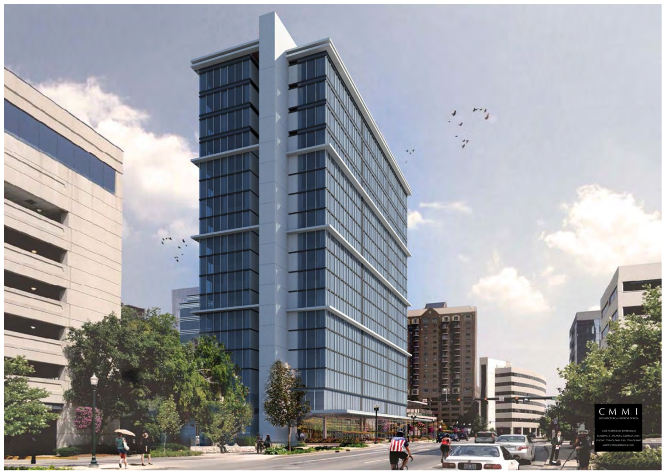
HOTEL AT CORNER OF UPPER AND VINE