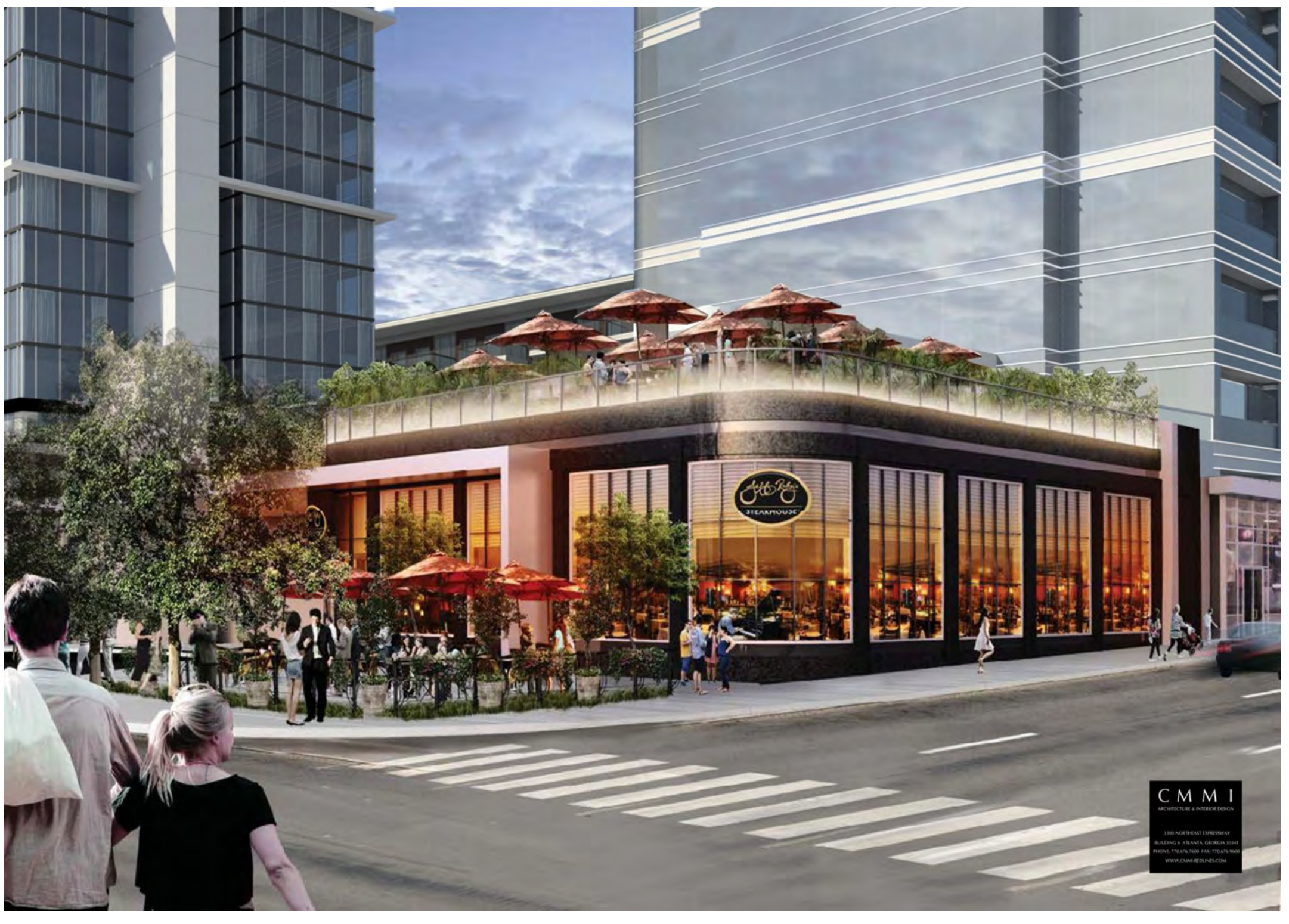
FEATURE RESTAURANT AT CORNER OF VINE AND LIMESTONE