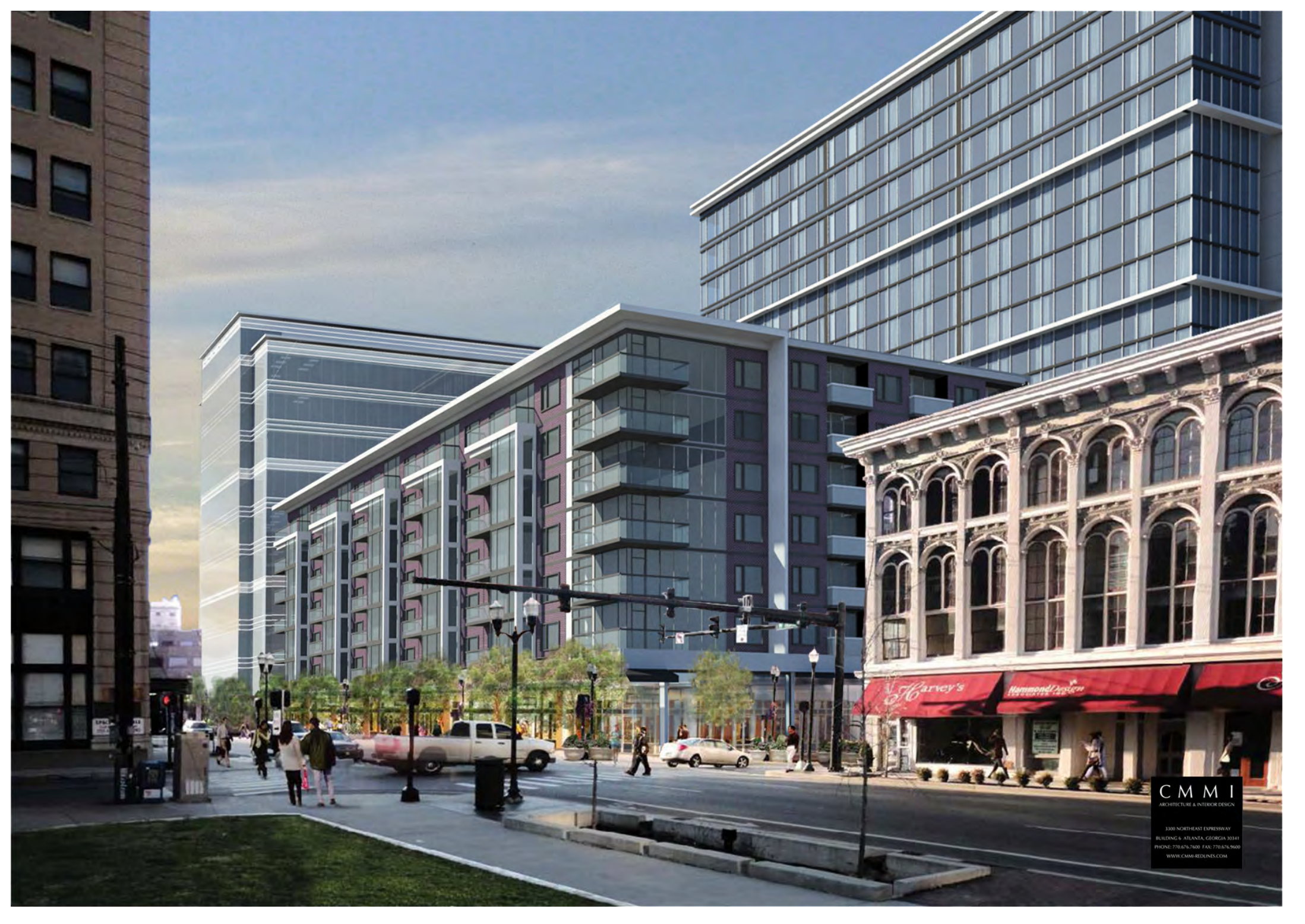
APARTMENT BUILDING AT CORNER OF MAIN AND UPPER