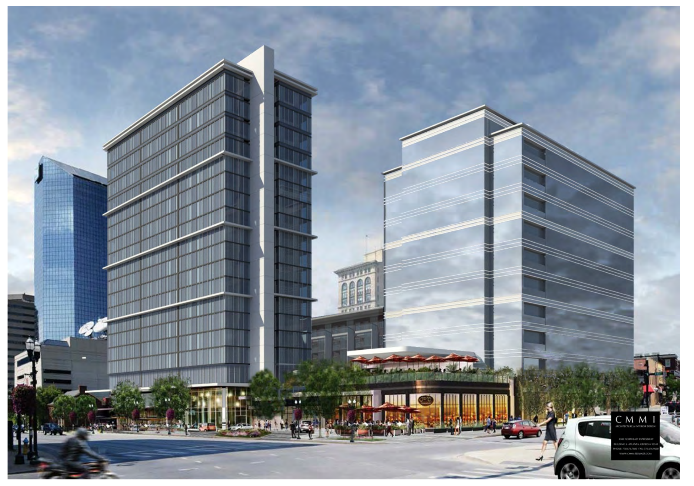
HOTEL, FEATURE RESTAURANT AND OFFICE AT CORNER OF VINE AND LIMESTONE