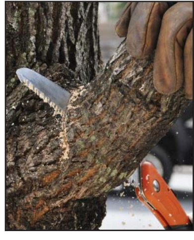
The final cut Should be made iust outside of the branch collar and the branch bark ridge. Avoid making pruning cuts flush to the trunk and do not leave branch stubs. The use of a tree wound dressing is not recommended.