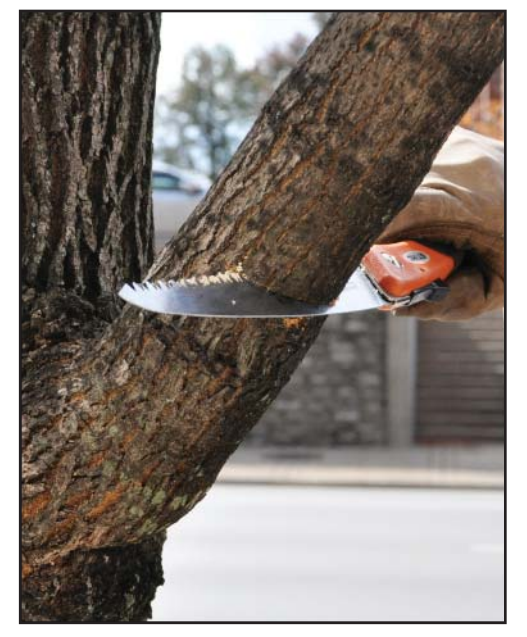
4 Start by making the first cut on the underside of the branch. Cut half way into the branch. This will prevent the bark from tearing and stripping the bark from the trunk.